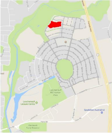
(MAP DATA @2017 GOOGLE AUSTRALIA) SITE PLAN

SPECIAL NOTICE TO PURCHASERS No guarantee can be provided that the final lots will exactly reflect those shown on this plan. Fencing and landscaping packages also available. (conditions apply) All areas and dimensions are subject to final survey.